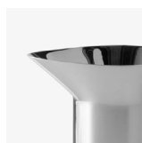
→ Polished Stainless Steel