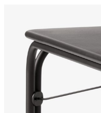
→ Warm Black