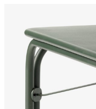
→ Bronze Green